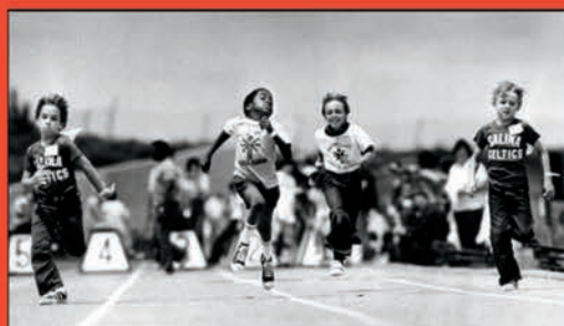
1st Summer Games in 1970